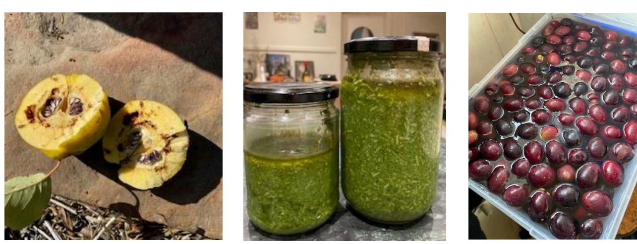
Fruit Fly and Codling Moth in Quince

Fortunately, we are not starving! Friends have shared their abundance of eggs, and the simplicity of a basil pesto can save the day! Also, the olive trees are heaving with fruit and I am loving the extended process of preserving the olives in brine.