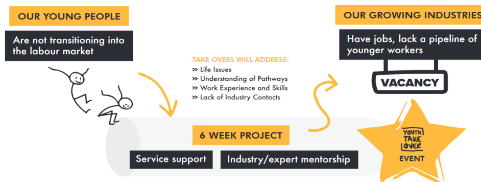
Figure 2. The Youth Take Over model for community/industry work experience.

100 Work experiences provided in Loddon Campaspe (to date)