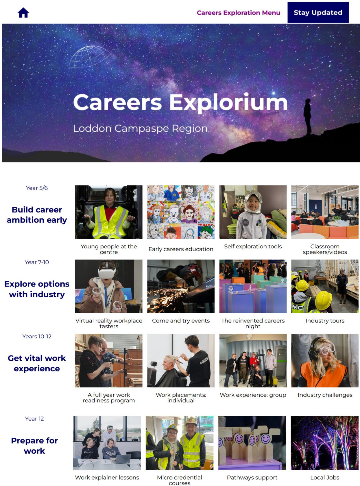
Figure 1. The Careers Explorium.